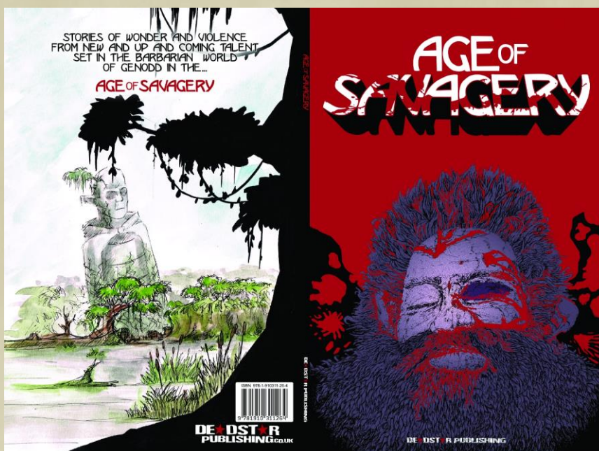
Age of Savagery cover spread

The first book was 80 pages of full colour sequential art and illustrated prose featuring work from 22 creators – many of whom saw their work published for the first time. Their collaboration brought the first volume to fruition and in doing so set the stage for the world of Genodd and its inhabitants. This will be similar: a full colour graphic anthology of 80-120 pages exploring new themes within that existing world.